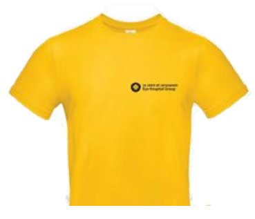
Unisex SJEH Tshirt (Gold) S/M/L available £15