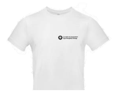
Unisex SJEH Tshirt (White) S/M/L available £15