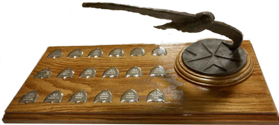
The route of the Travelling Swift - 2019-20