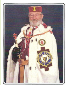
GRAND MASTER ORDER OF THE TEMPLE May 2011 to May 2017